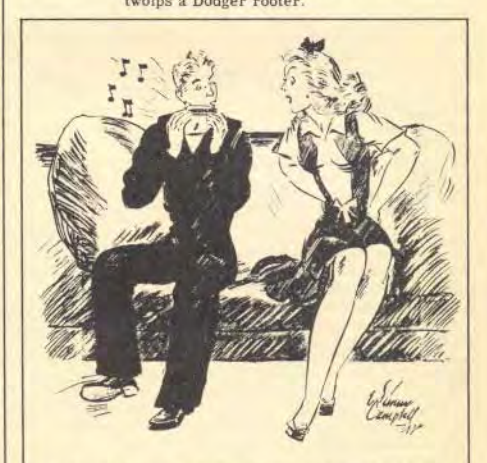
"After two years in the Pacific, you mean THAT'S the surprise you had for me?

Here I finda myself a sweetie, and da twoips a Dodger rooter.